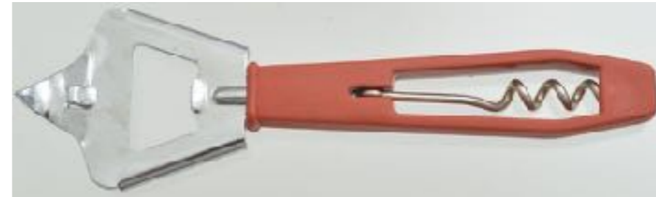
FG75 Probus multi-tool. British Registered Design No. 980,867 by Gill-Mentor Limited, West Midlands, July 23, 1977. Also British Patent 1,575,063 issued September 17, 1980. $19