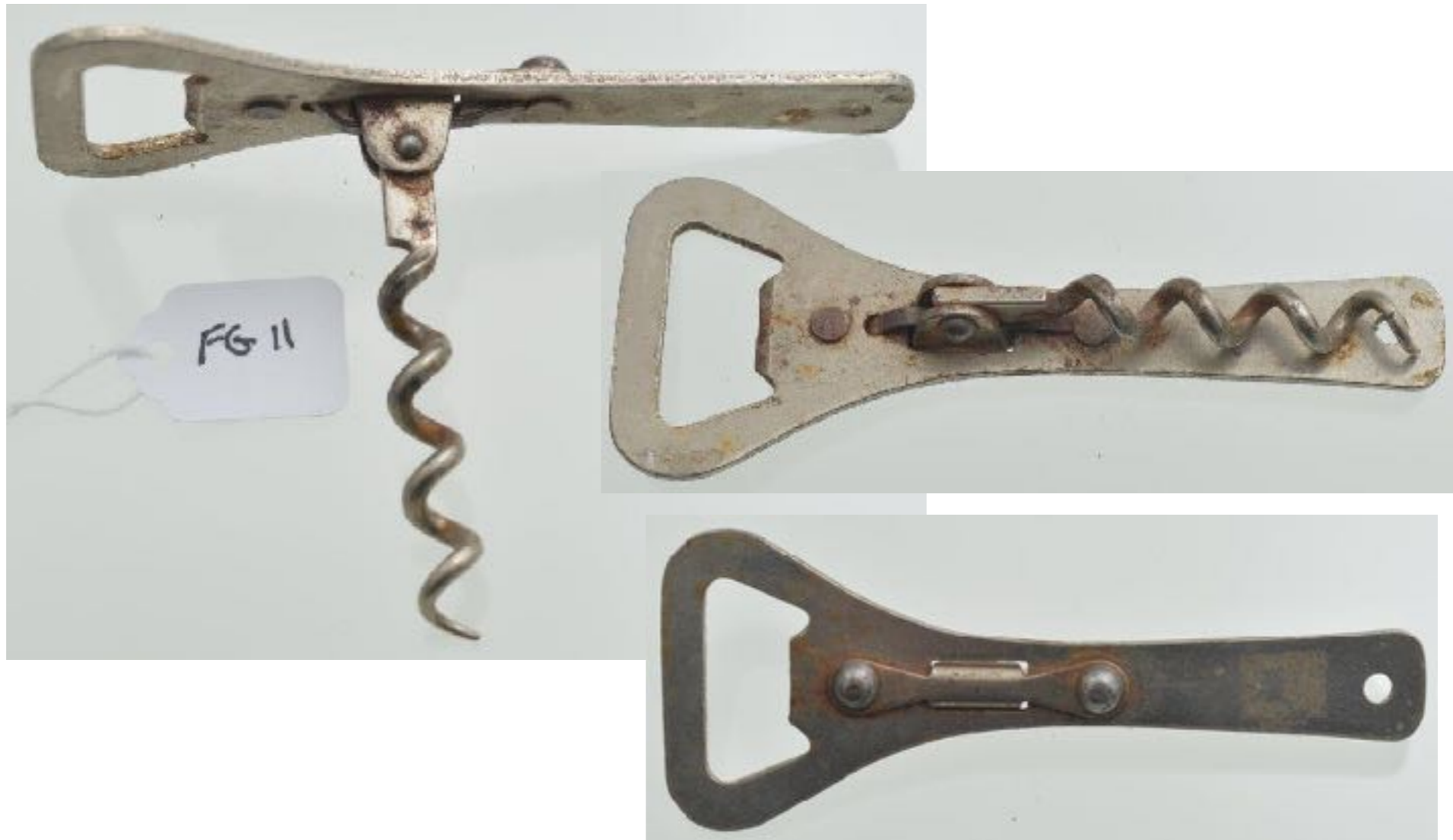
FG11 Combination corkscrew and bottle cap lifter. It has a very substantial backspring to keep the worm in place when folded out. $29