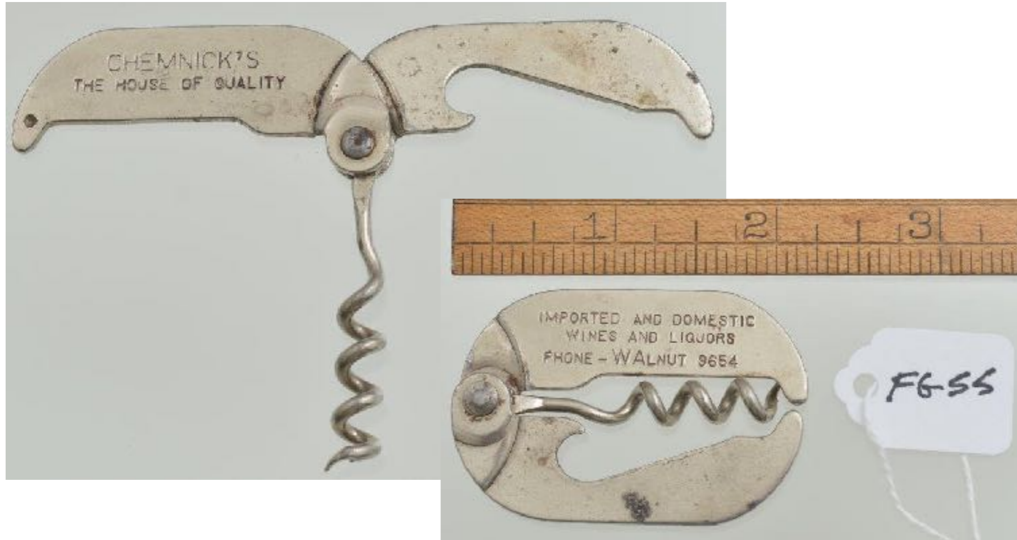
FG55 The "Tip Top" combination corkscrew and bottle cap lifter by Williamson Company, Newark, New Jersey. Advertising "Chemnick's, the House of Quality." $50