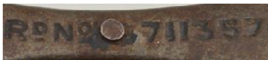
EE93 British Registered Design 711357 by Coneys Ltd, Feb. 26, 1925. The can opener blade is missing. $75