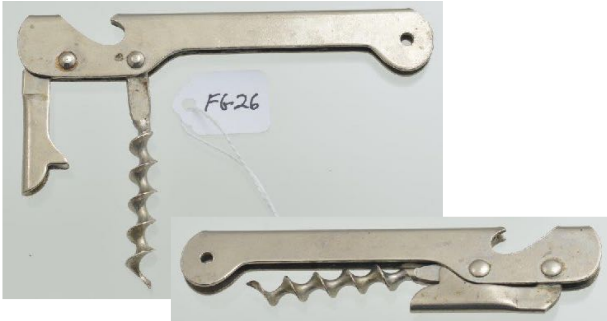
FG26 A really cheaply made waiter's friend corkscrew. $10