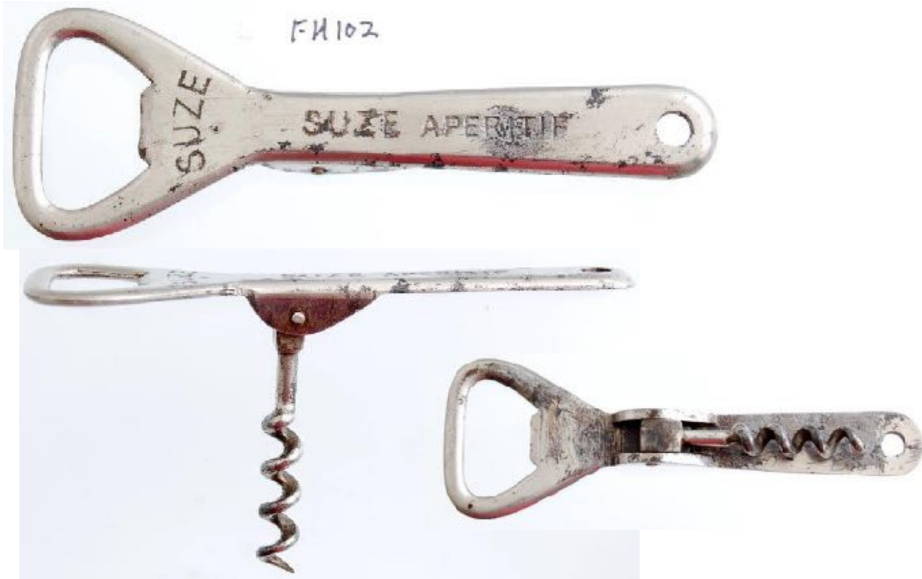
FH102 Suze Aperitif. $49