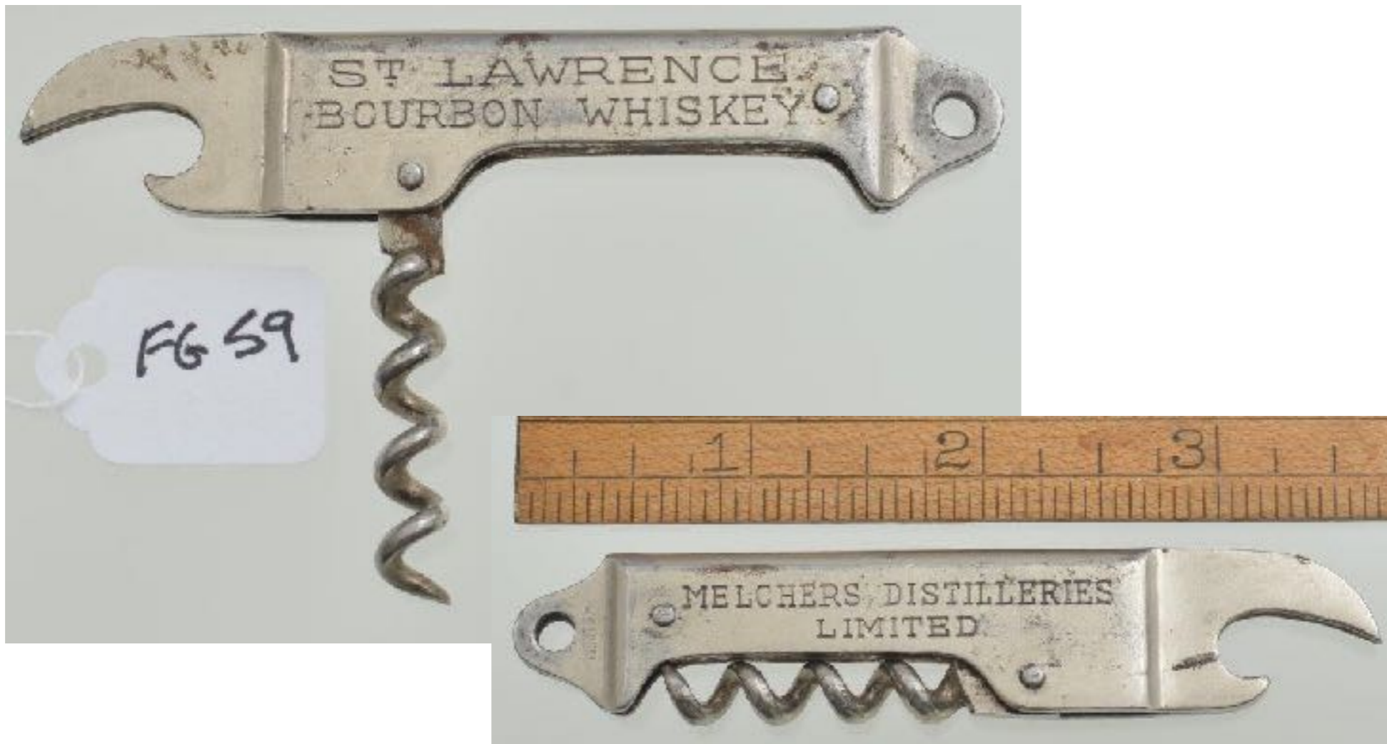
FG59 Combination corkscrew and bottle cap lifter advertising “Melchers Distilleries Limited, St. Lawrence Bourbon Whiskey.” Although this is in the “Nifty” form, it is a much more substantial piece. $69