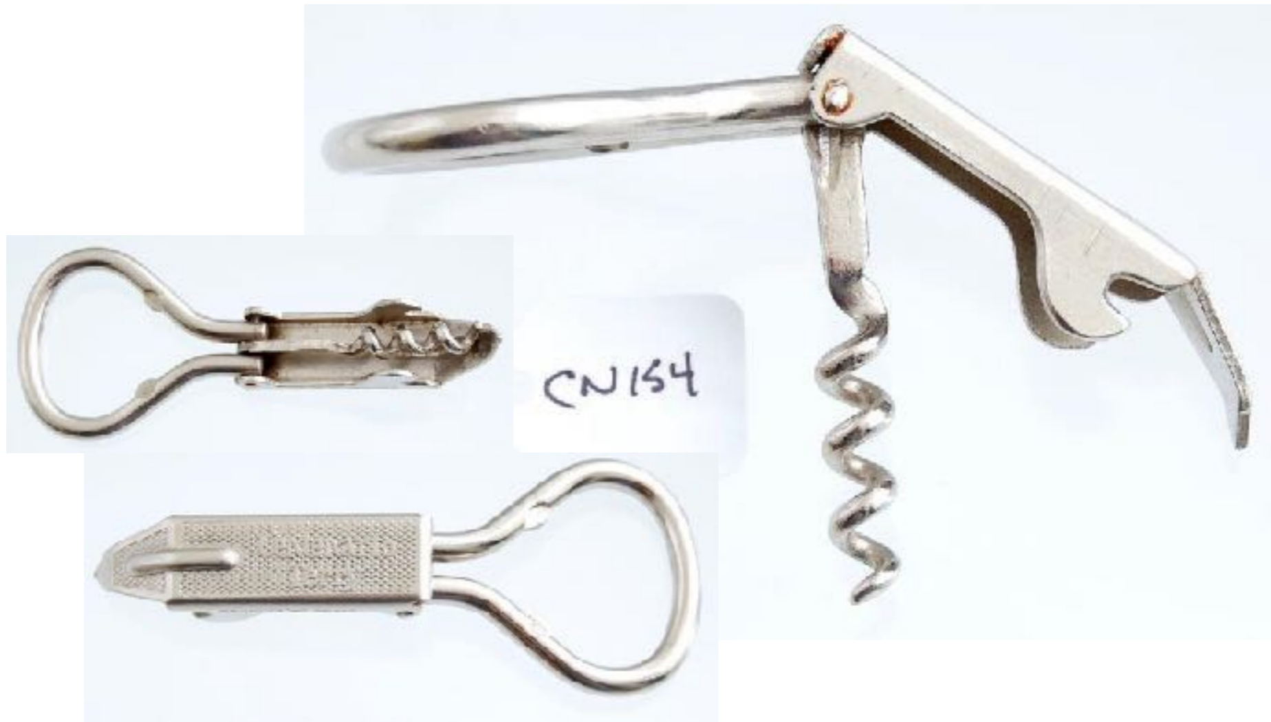
CN154 Folding combination tool. Advertising "Centenario Terry" on the stippled top. Side marked PRODUCT OF SPAIN. $75