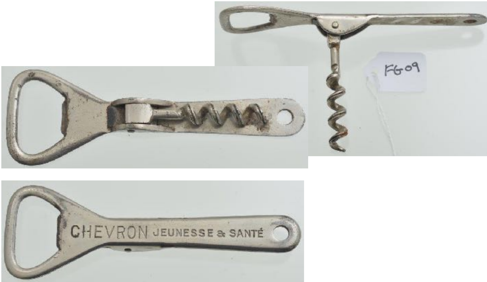
FG09 German 1928 Registered Design 1,049,529 by Solinger Metallwaren Fabrik GmbH. Also patented in France in 1931 (no. 702,997). Advertising "Chevron Jeunesse & Sante." $59