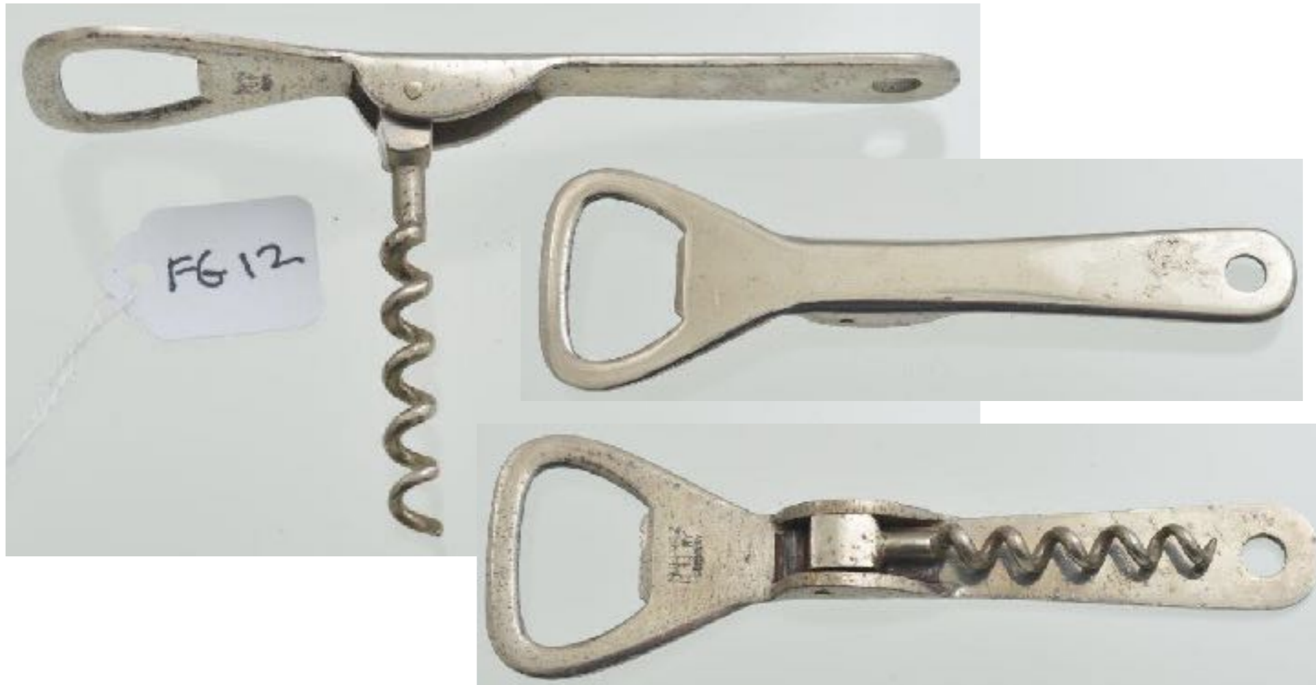
FG12 German 1928 Registered Design 1,049,529 by Solinger Metallwaren Fabrik GmbH. Also patented in France in 1931 (no. 702,997). Marked HOFFRITZ NY GERMANY. $49