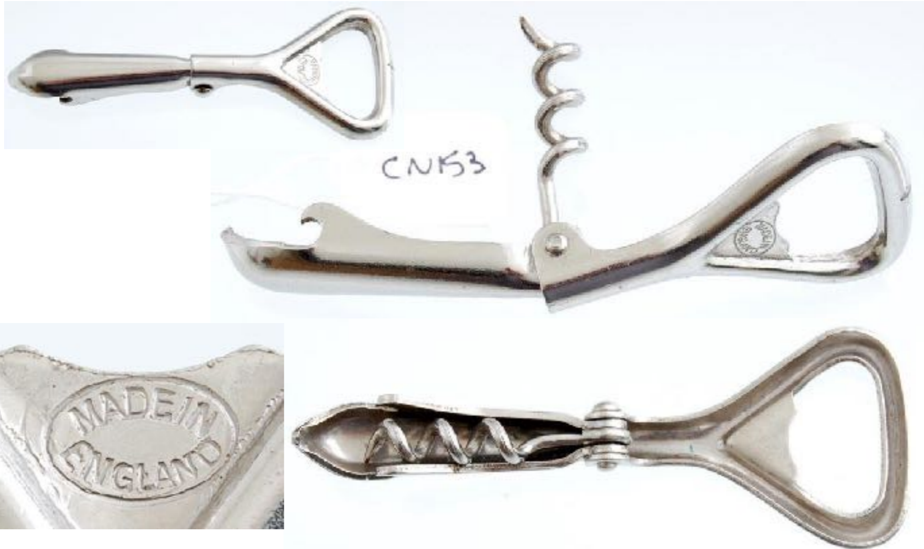
CN153 Folding combination tool. MADE IN ENGLAND. $25