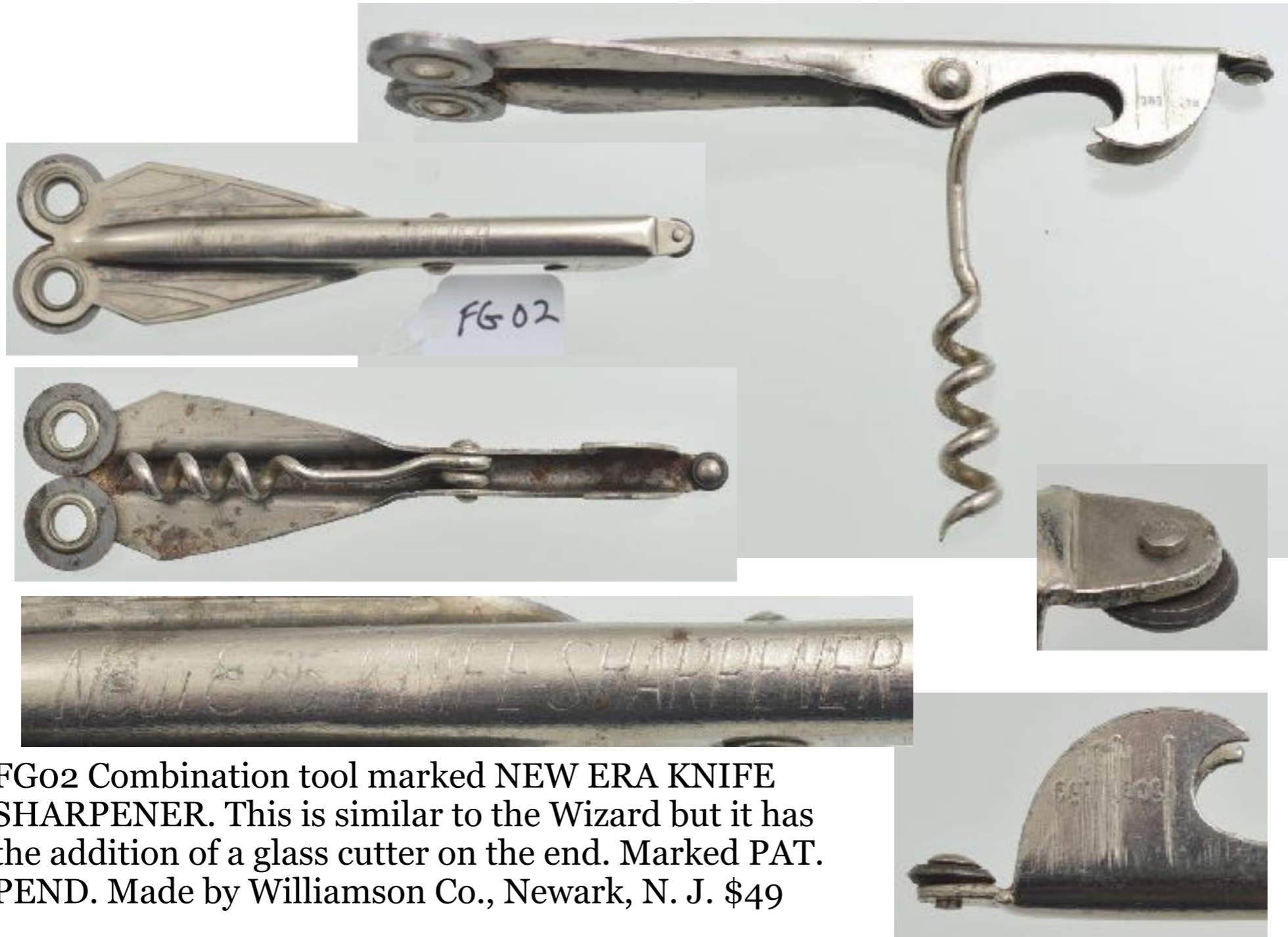
FG02 Combination tool marked NEW ERA KNIFE SHARPENER. This is similar to the Wizard but it has the addition of a glass cutter on the end. Marked PAT. PEND. Made by Williamson Co., Newark, N. J. $49