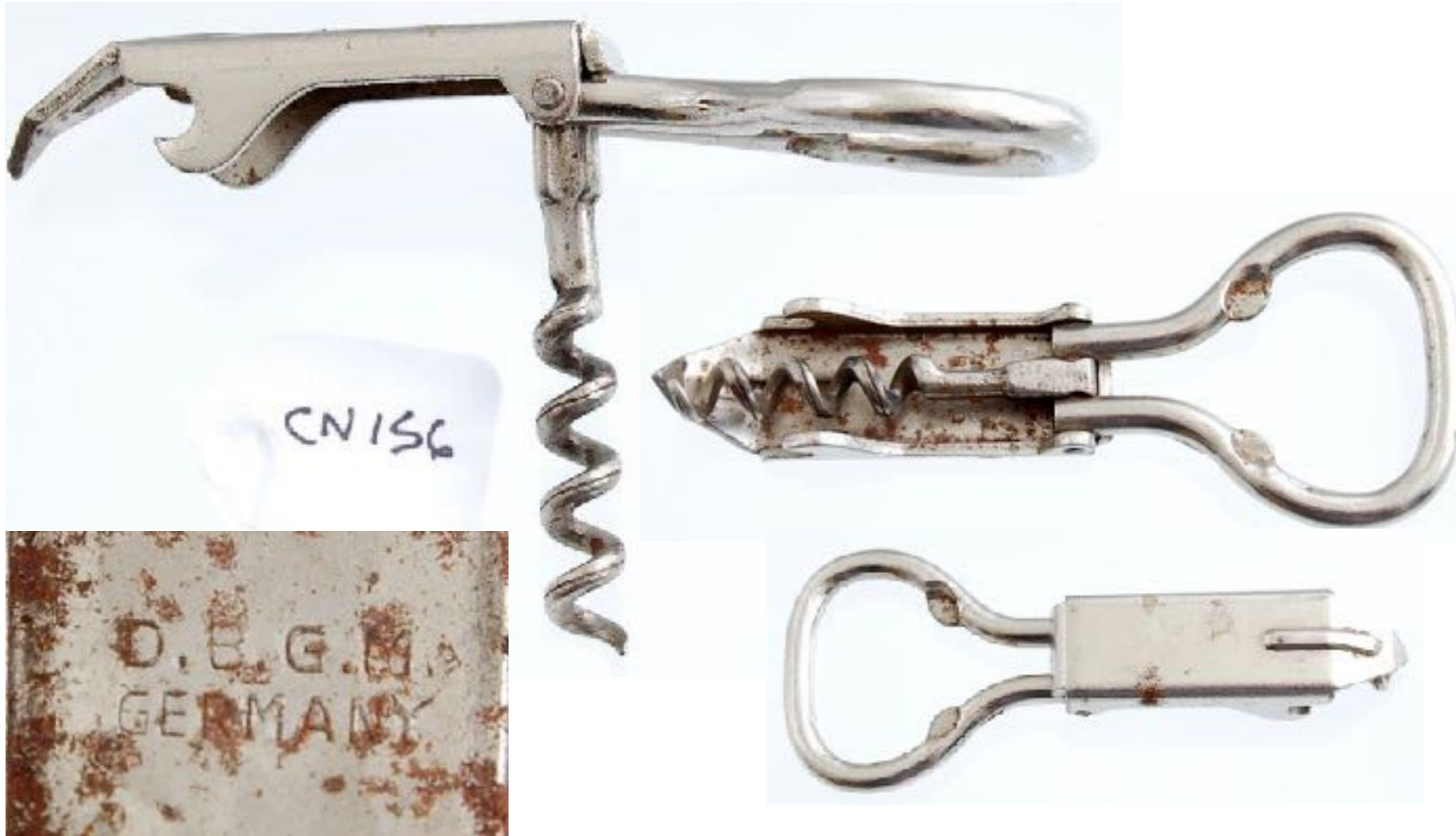
CN156 Folding combination tool marked D.B.G.M. GERMANY. $59