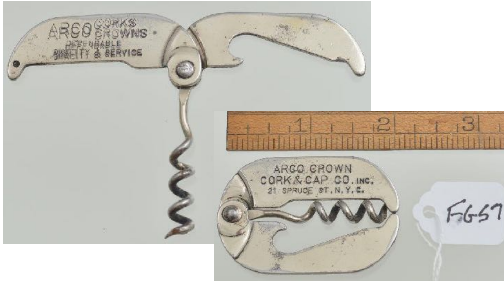
FG57 The “Tip Top” combination corkscrew and bottle cap lifter by Williamson Company, Newark, New Jersey. Advertising “Arco Crown Cork & Cap Co., Inc., 21 Spruce St., N.Y.C.” $69