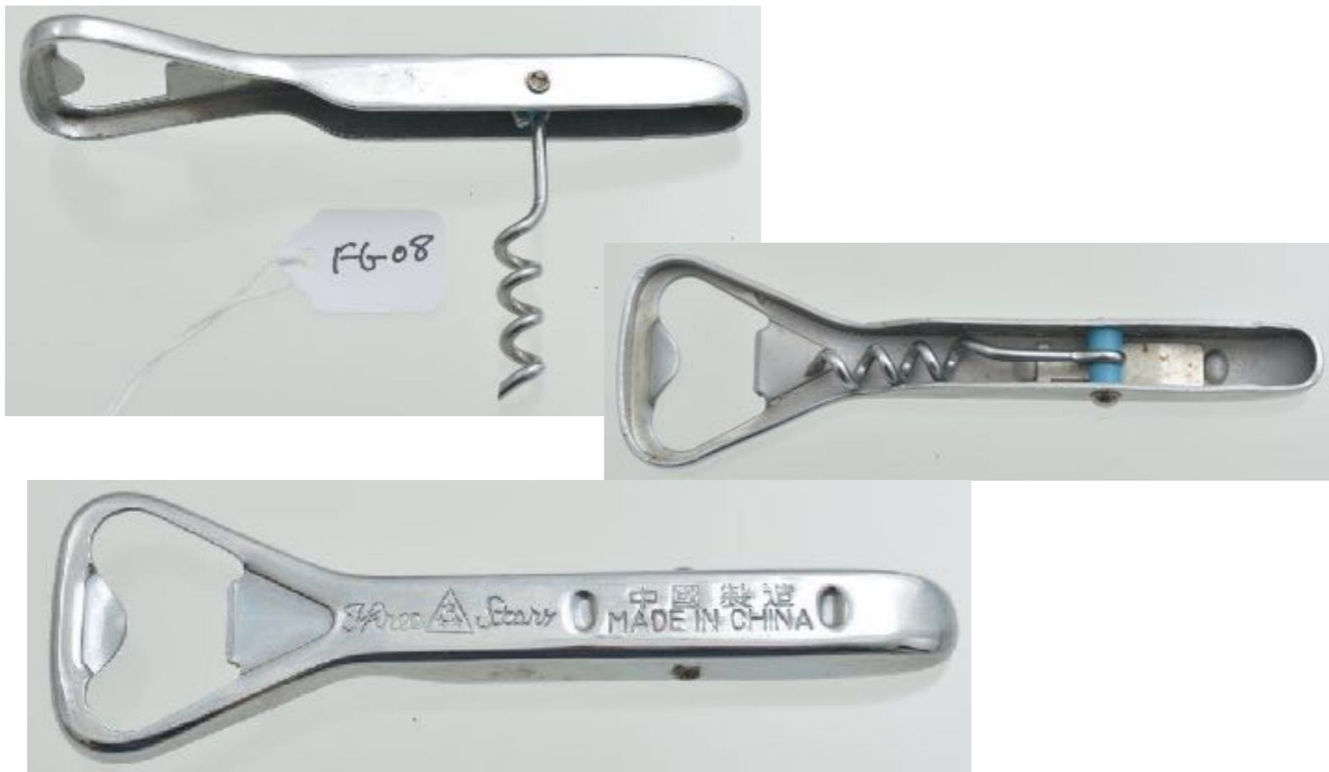
FG08 Combination corkscrew and cap lifter marked THREE STAR MADE IN CHINA. $19