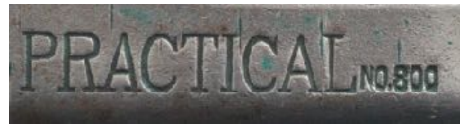
FG49 A well-marked combination corkscrew, bottle cap lifter, and can opener. $60