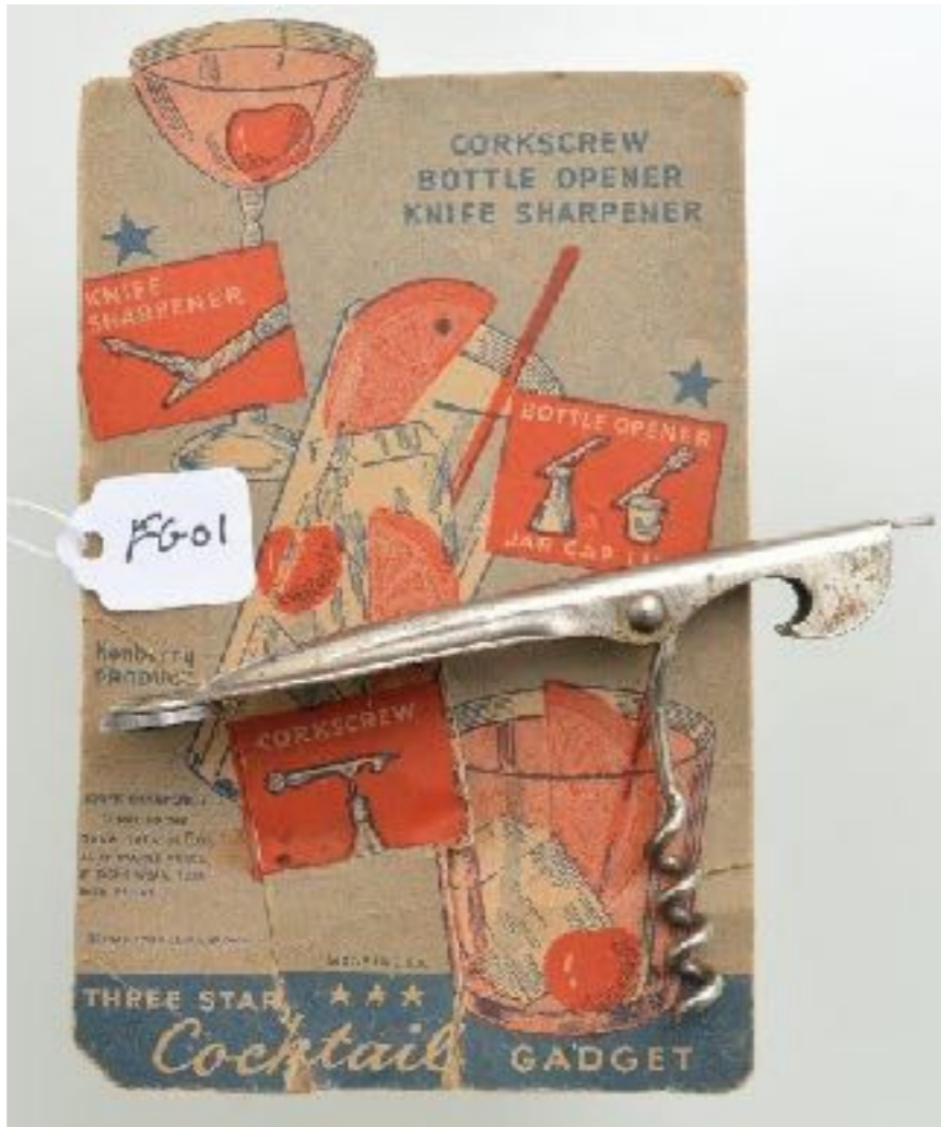
FG01 Combination tool marked WIZARD KNIFE SHARPENER. Includes original card (torn). Corkscrew, bottle opener, and knife sharpener. Made by Williamson Co., Newark, N. J. $55